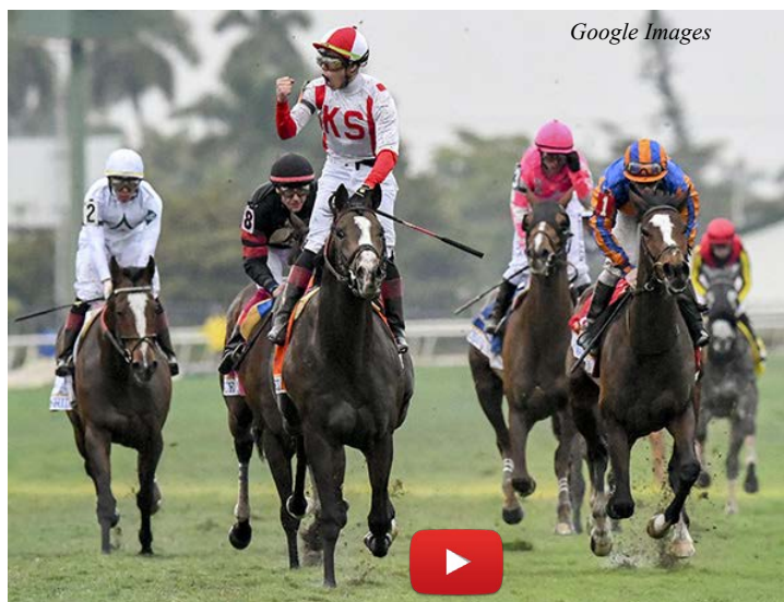
Bricks And Mortar