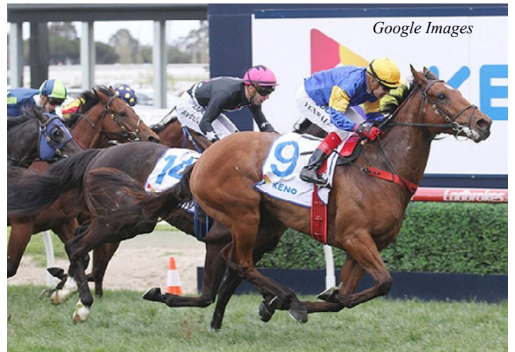
Santa Ana Lane

Also Ran: Flamberge, Super Cash, Steel Frost, Handsome Thief (Ire), Vega Magic, Exalted Adam, Voodoo Lad, Overshare, Mica Lil, Viddora, Stellar Collision, Nipperkin, Secret Agenda, Viridine, Lope de Capiro, Ferrando (NZ), Thronum.