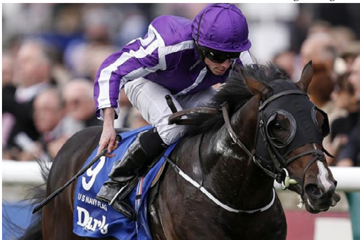
US Navy Flag

WOODBINE (Can) – 15/Oct. CANADIAN INTERNATIONAL STAKES-G1 2400mT – 3yo/up - 2'34"370 – C$800,800,