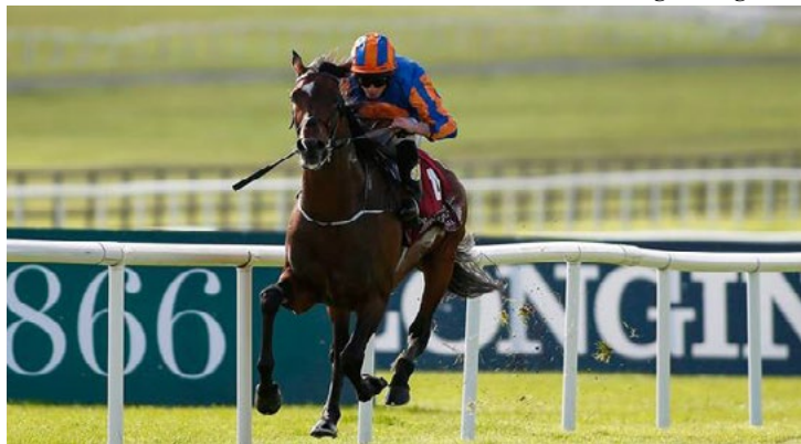
Order of St. George